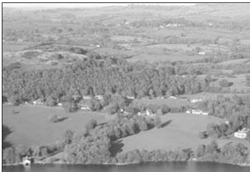
View of Ullswater