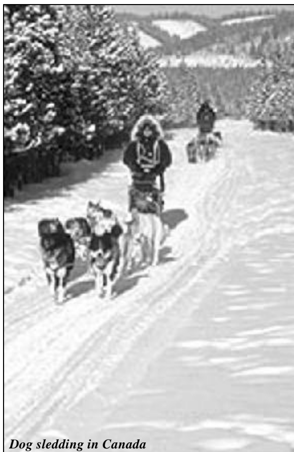
Dog sledding in Canada

An enriching component of Outward Bound Canada's winter course is the sled dogs, each with their individual personalities. For example, Ramage love to start the morning songs and evening howls, and Kubota (named after the base camp generator) even after a long day enjoys playing and jumping around with her teammates on the campsite tie-out. The relationships that develop between the students and the dogs act as a catalyst in the experiential learning process. Over an eight-day program, student confidence will grow both inward and outward as he or she travels with the strong and hardworking dogs. The dogs show a determination that is infectious and teaches the students to push themselves and endure the adverse conditions. It does not take long for the students to see why the huskies are always fed first.